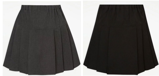
Black Knee or standard-length socks